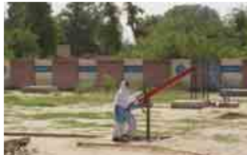
Girls pumping water using hand pump

Overall, girls' schools in Mianwali fared better in terms of infrastructure than those in Rajanpur and Hafizabad.