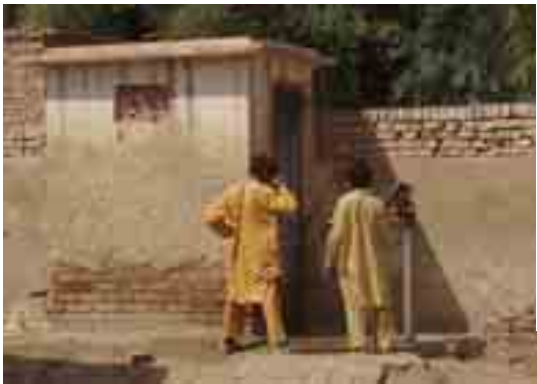
Boys drinking water next to latrine

Aside from classroom blocks, schools rarely had staff rooms and in some cases, there was no office for the head teacher. The condition of the latrines was very basic and the ratio of students to latrines was high. At one boys' school visited in Mianwali, teachers explained that the one latrine in the school was only used by teachers and that the 400 students were expected to go out of the school boundary to relieve themselves. In the past year, this resulted in a young boy at the school being run over when attempting to cross the road outside. Water supply is also limited. During break times, students were often seen queuing near water wells with hand-operated pumps.